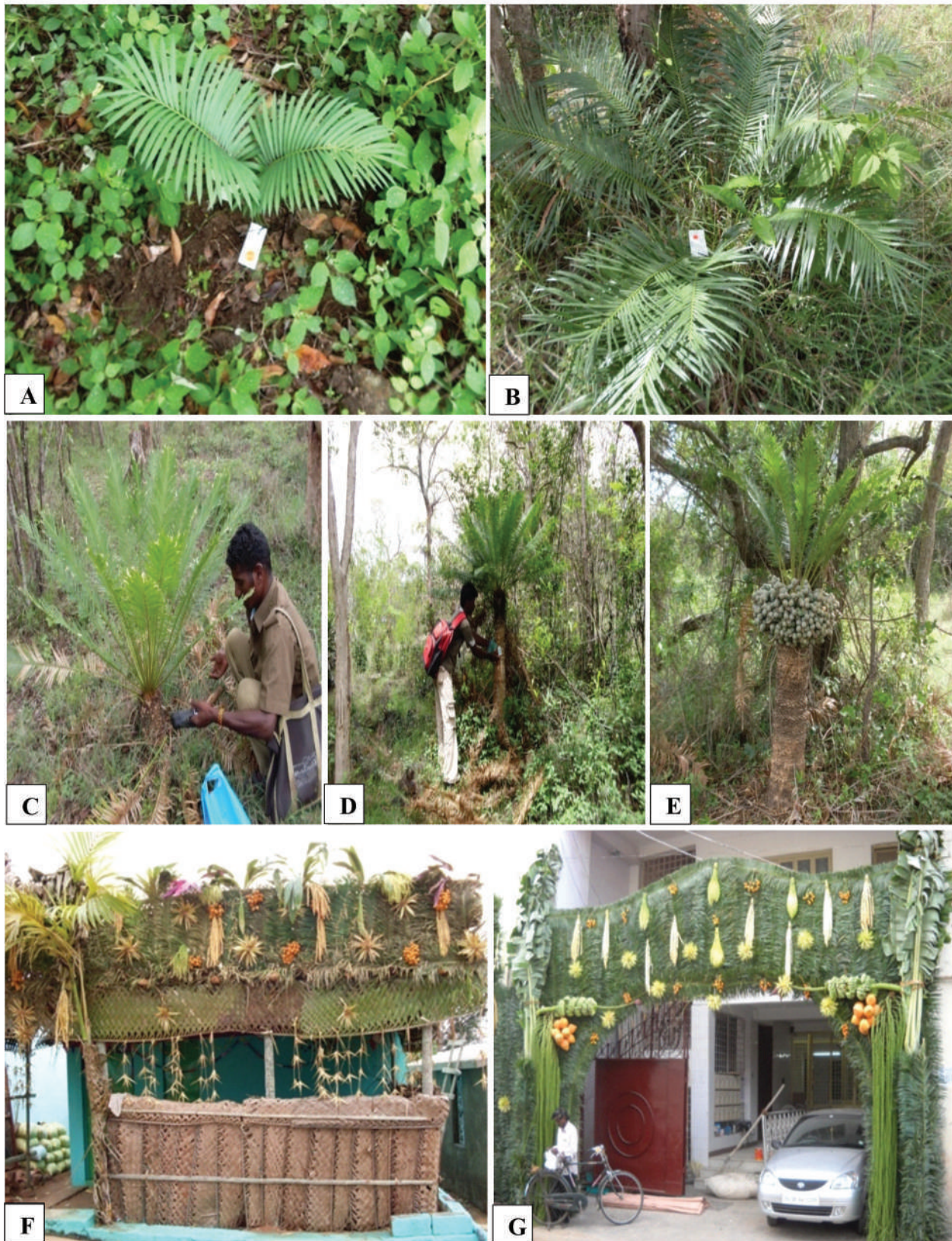
Figure 2. A. Seedling. B. Juvenile. C. Non-reproductive adult. D. Adult male. E. Adult female. F. Cycas leaves decoration in tribal wedding. G. Cycas leaves decoration in cities.